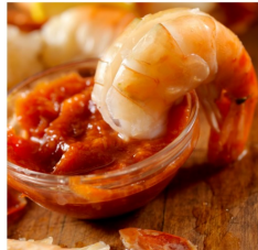
PEEL & EAT SHRIMP