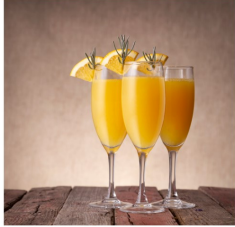
COMPLIMENTARY MIMOSA APRIL 21